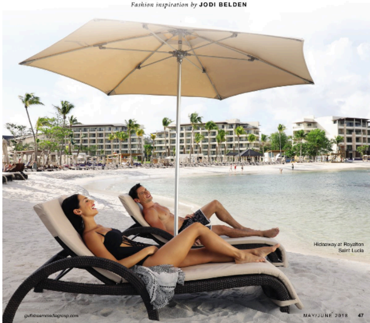
Hidesaway at Royalton Saint Lucia